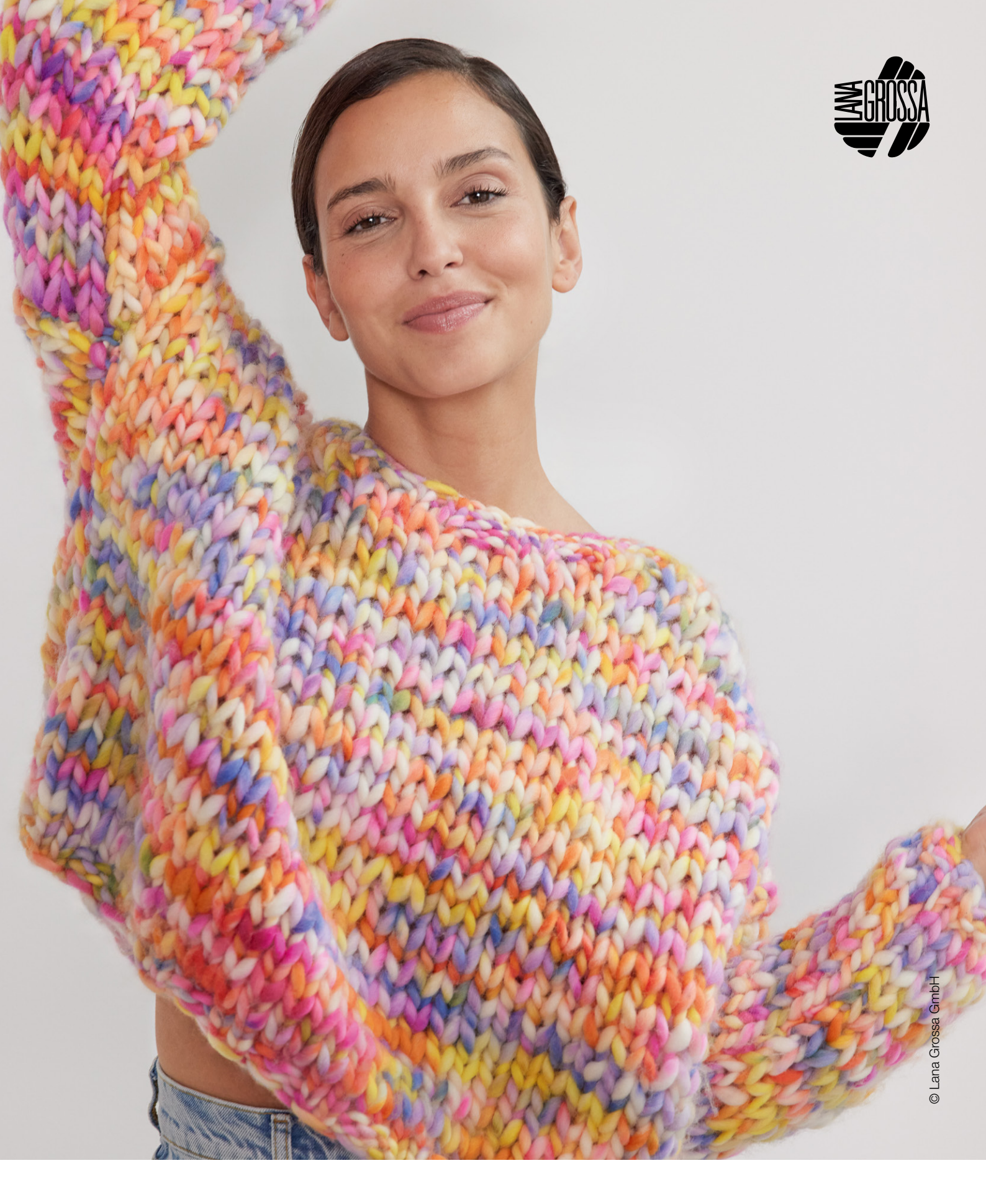
Design 4 – Flyer Confetti