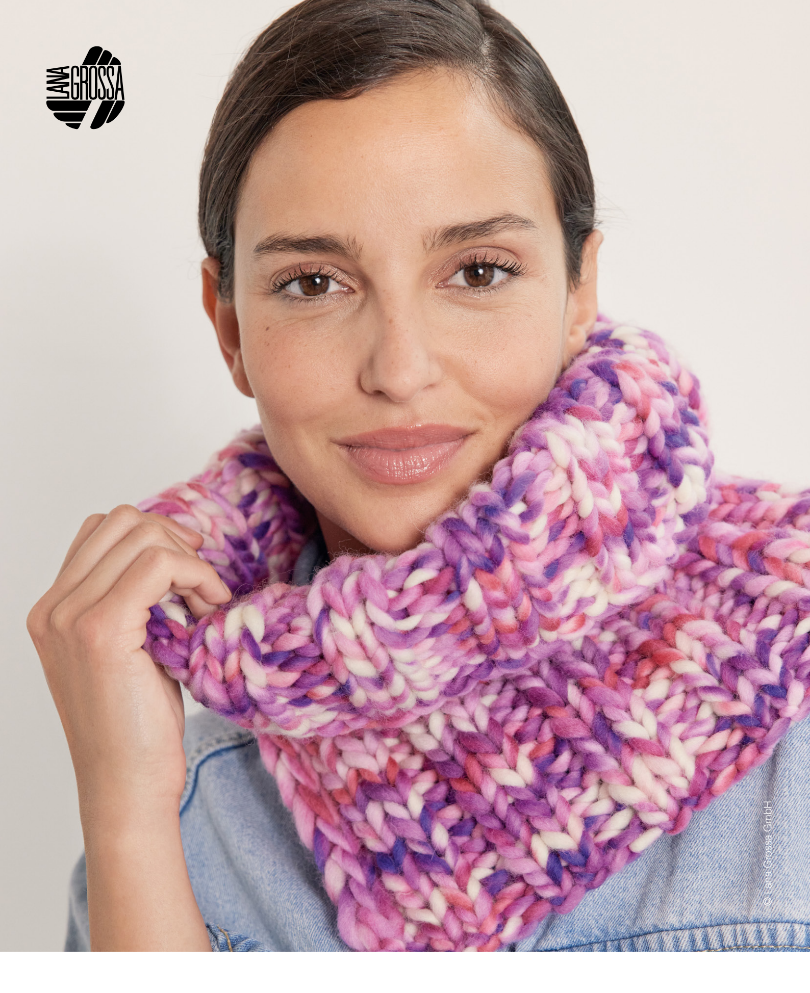
Design 1 – Flyer Confetti